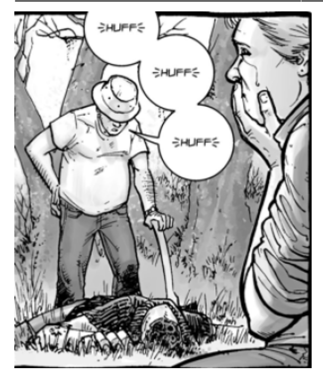
"Sniff, sniff." He smells something in the air.