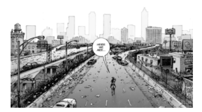
Extreme wide view