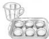
Baking custards in a water bath

▶ Allow time to chill the baked custards thoroughly before serving. Always store cooled custards or custard-based dishes tightly covered in the refrigerator, as they readily take on the flavors of strong-smelling foods.