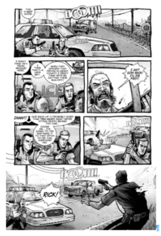
Six panels in four rows.

Row one has one wide panel, rows two and three each have two square panels, and row four has a wide, borderless panel with an image that bleeds behind the panels above.